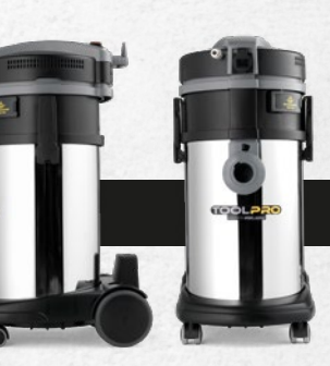
POWER TOOL PRO FD 36 I EL