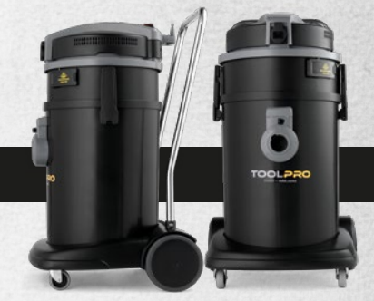
POWER TOOL PRO FD 50 P EL